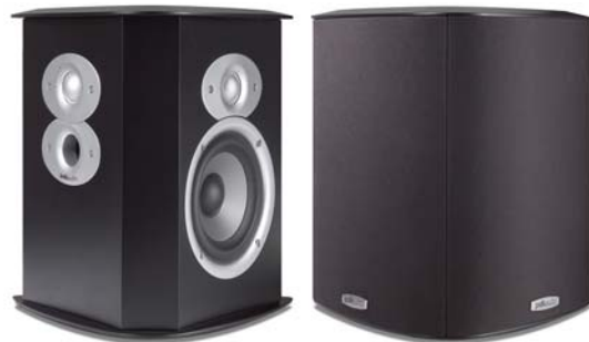
F/X i A6 Surround Loudspeaker