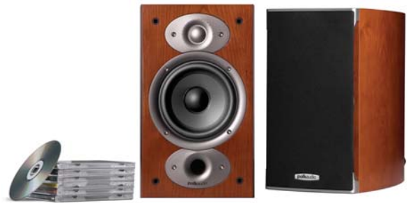
RT i A1 Bookshelf Loudspeaker