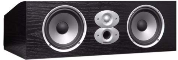
CS i A4 Center Channel