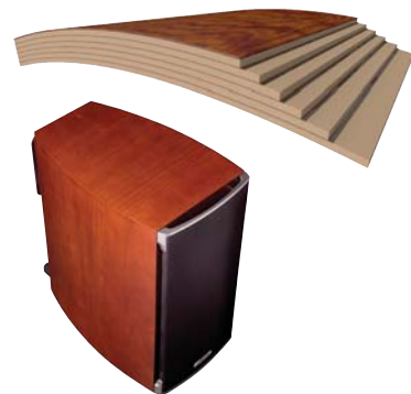
Top View of RT i Cabinet Design