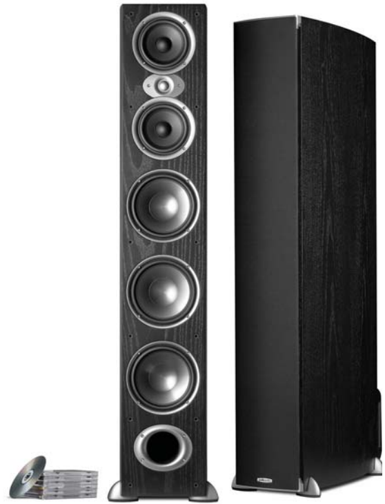
RT i A9 Floorstanding Loudspeaker